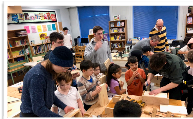
Planter Project, February 2020

their ability to read and also improve their writing. Throughout the school, students are demonstrating their improved skill in reading. Our students are becoming more confident in all subject areas as a result. The best way to improve reading is experiencing books. Reading with your child and asking questions about what they have read is the best way to help kids learn to love reading and writing!